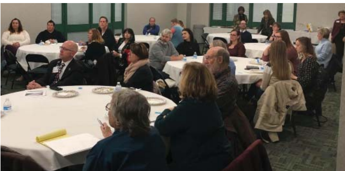
Attendees at the Annual Meeting.