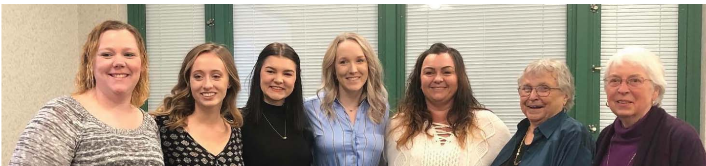
2018 Scholarship winners and award committee members.